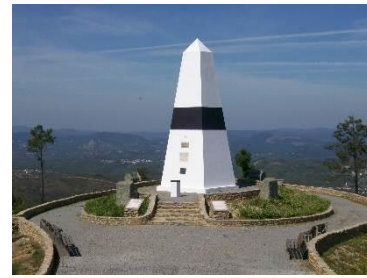
Geodesic Center of Portugal

Defined to the north by the Isna river, to the south by the Codes river and the west by the Zêzere river, Vila de Rei considers itself as a peninsula, which can be seen specifically in the landscape. Characterized by a mountainous territory, reaching altitudes close to 600 meters, as is the case of the Serra da Melriça. Vila de Rei has privileged road accesses. For visitors coming from the south are recommended to the A1, followed by the A23 Torres Novas up to Abrantes and then following the EN2 to Vila de Rei. For anyone coming from the north it is recommended the IC8 and then the N2.